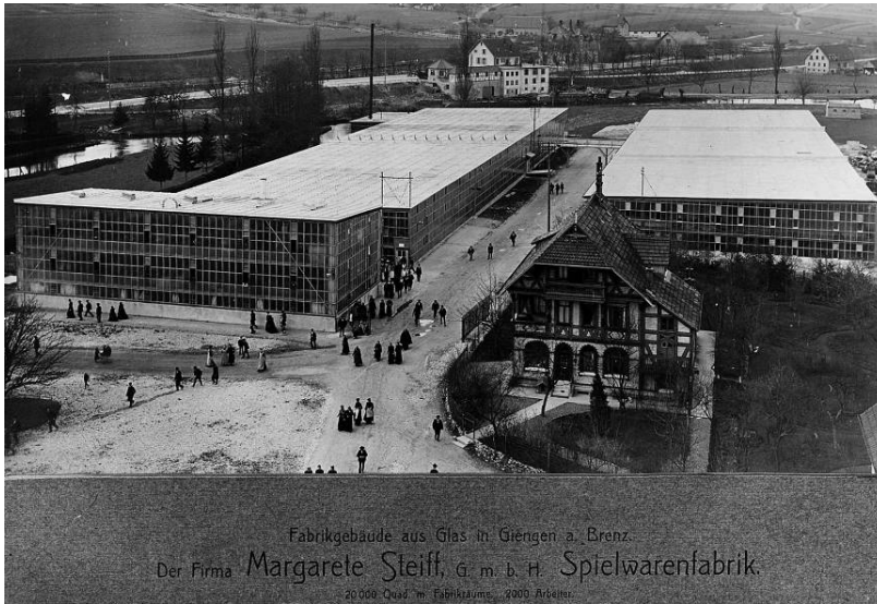
Depicted item: Steiff Factory